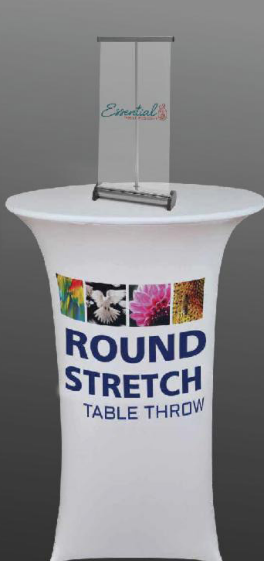
PHOENIX MINI TABLETOP