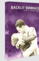
5' full height standard display footprint dimensions: 59.81" w x 88.94" h x 23.25" d EMB-2-BL-2X3-S