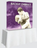
5' tabletop footprint dimensions: 59.81" w x 60" h x 14.5" d EMB-2-BL-2X2-S

Backlight kits also available a la carte!