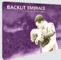
10' full height standard display footprint dimensions: 117" w x 88.94" h x 23.25" d EMB-2-BL-4X3-S