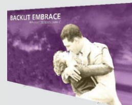
12 ¼' full height standard display footprint dimensions: 146" w x 88.94" h x 23.25" d EMB-2-BL-5X3-S